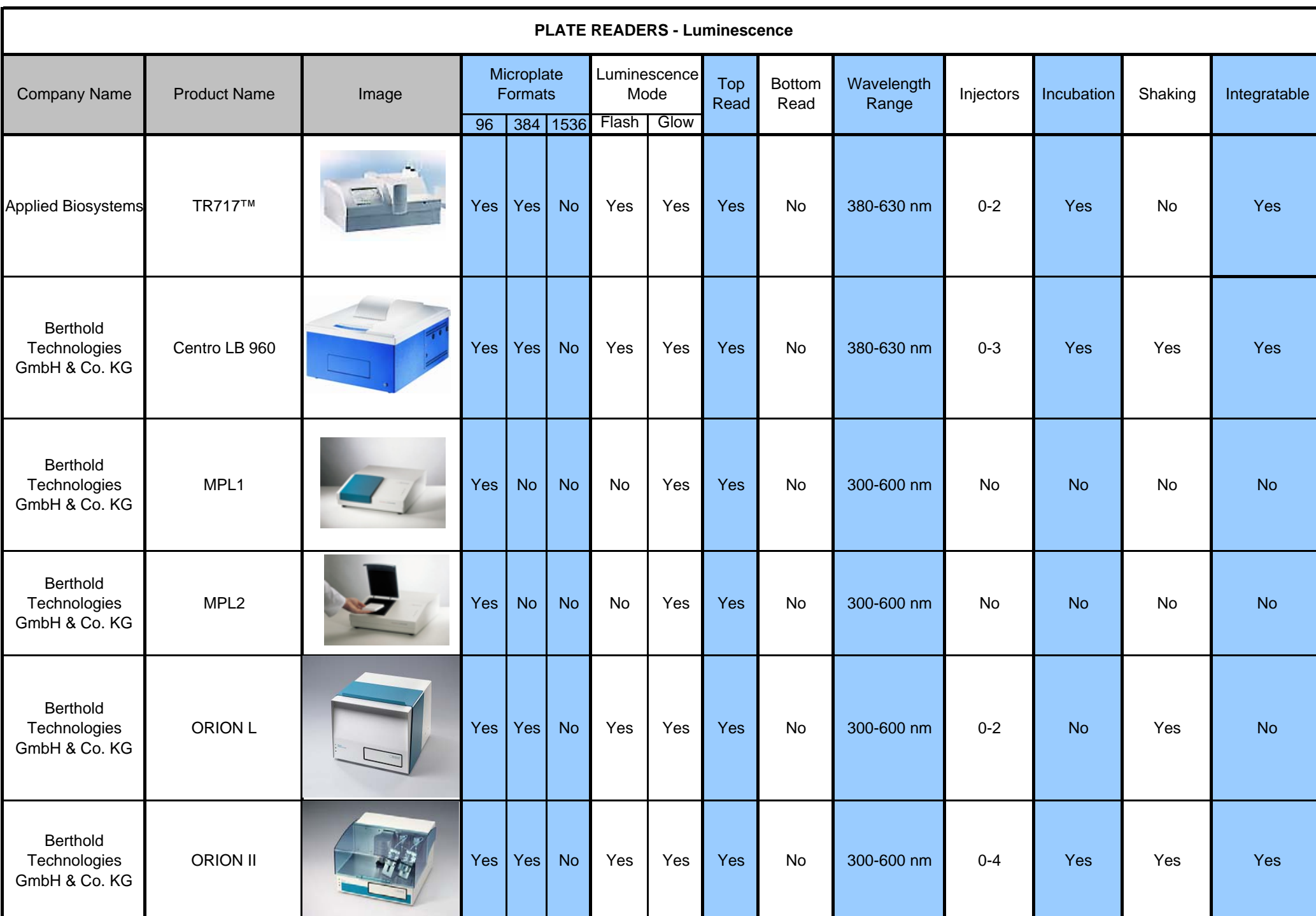
PLATE READERS - Luminescence