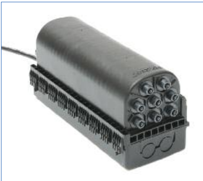
Output End of 8-Port Ruggedized Zone Enclosure | Photo LAN1657

Corning Cable Systems AnyLAN™ Ruggedized Zone Enclosure combines the AnyLAN OptiTip™ adapter with a sealed closure for quick and easy deployment, eliminating the need for field-terminated fiber optic cables. The enclosure is fully compatible with existing Plug & Play™ AnyLAN solutions and is ideal for easy installation of zone architectures. The factory-terminated enclosure eliminates time required for field-termination methods while providing industry-leading quality and reliability. The ruggedized zone enclosure is easily mounted in trays, on poles or can be direct buried for increased design versatility. Environmentally hardened MTP® preterminated ends offer quick overall system deployment in even the harshest environments.