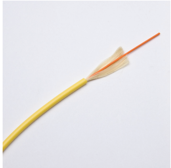
ClearCurve Compact Drop Cable | Photo CCV016

The cable consists of a single bend-insensitive fiber tight-buffered with a 900 µm jacket, surrounded by dielectric strength members and an outer flame-retardant jacket. With a standard yellow or optional neutral-toned jacket, this cable is riser rated (OFNR) for indoor vertical riser and general-purpose horizontal applications.