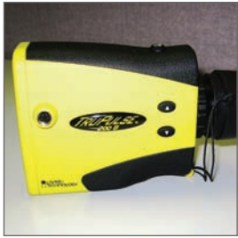
Laser Range Finder | Photo NS99