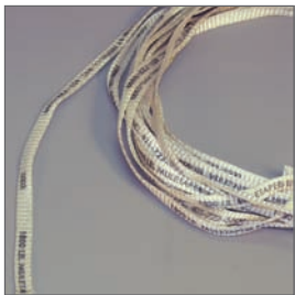
Duct Measuring Tape | Photo NS84

Ordering a Plug & Play™ AnyLAN™ Systems distribution trunk cable can be completed in three easy steps: