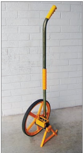
Measuring Wheel | Photo NS101